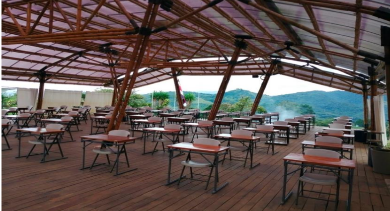
Image 1. Distribution of desks in Bamboo Main Hall